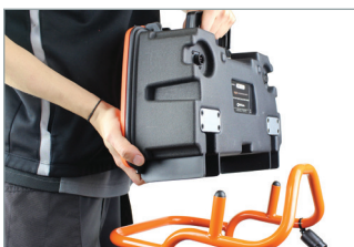
Easy-fit Control Unit