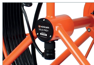
Integrated Meterage Counter